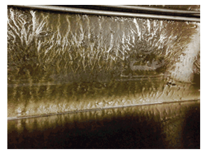
The above image shows dirt and grime removed with Ultrasonic Cleaning. Who'd want that in their working environment?